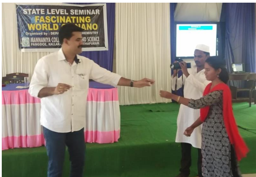
Preparation of Gold Nanoparticles during the seminar