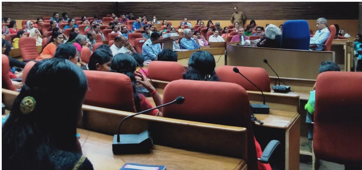
Ada Yonath sharing her research experience with students and faculty members

Most teachers and students worldwide often have little chance to meet and interact with Nobel Laureates. In such a situation, a Programme for inviting Nobel Laureates for the benefit of teachers and students to share knowledge in the concerned field is exceptionally significant. Five students of the Department of Chemistry attended the programme, ERUDITE – SCHOLAR IN RESIDENCE PROGRAMME organized by the Kerala State Higher education Council at Senate Chamber, University of Kerala, Palayam on 04 / 02 / 2019 . In this Programme, Eminent Nobel laureate in Chemistry Dr. Ada E Yonath, an Israeli Protein Crystallographer delivered lectures on X ray crystallographic Technique and atomic structure of the small ribosomal subunit and shared scientific advancements in her areas of research, provided academic career guidance to young researchers and suggested new research questions to them . Exposure to the knowledge and experience of the Nobel Laureate tremendously influences our students, not only intellectually but also psycho-socially by enhancing self-esteem and self confidence.