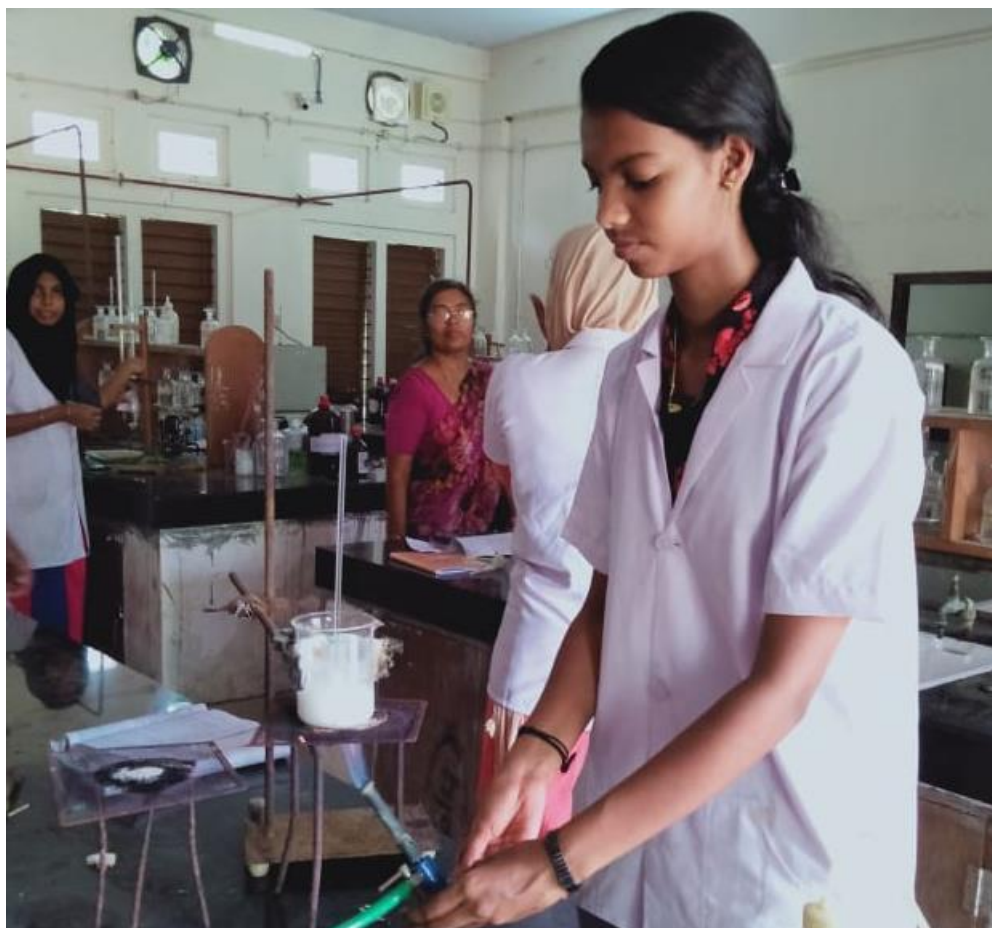
Estimation of DRC