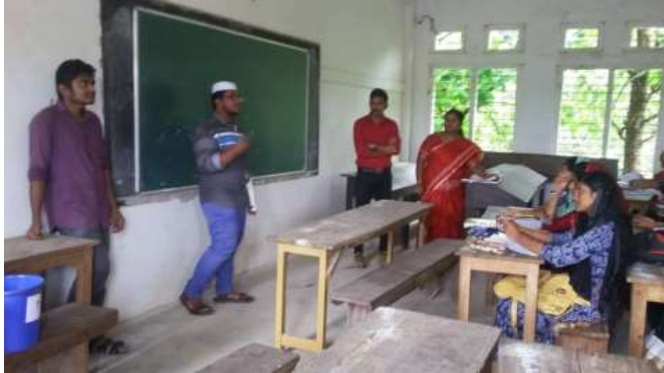
Plastic free campaign

We initiated a green army for the theme green campus, clean campus. The volunteers conducted one week campaign in all the classes for making our campus plastic free. The programme is a joint initiative of creativity hub, NSS and nature club.