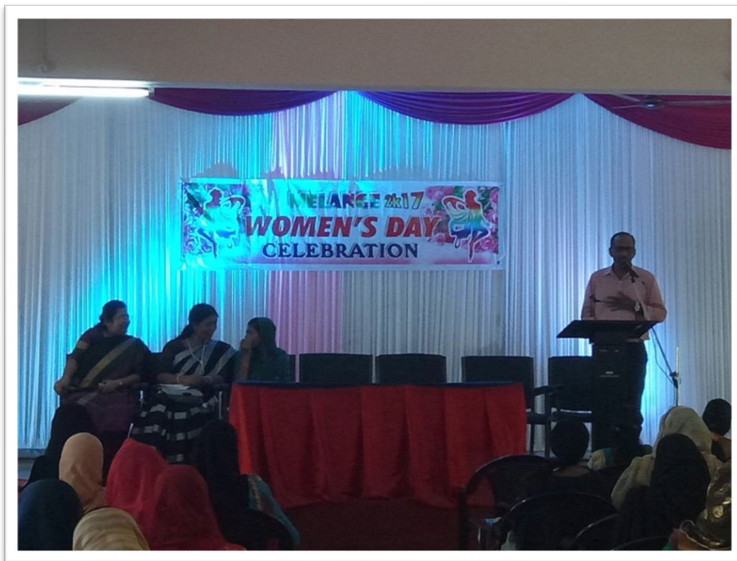
Welcome address delivered by the principal.