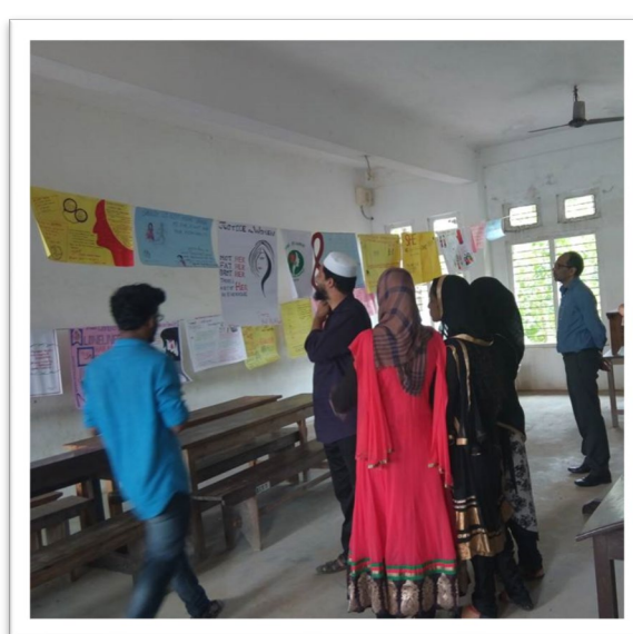
Poster exhibition inaugurated by the principal...