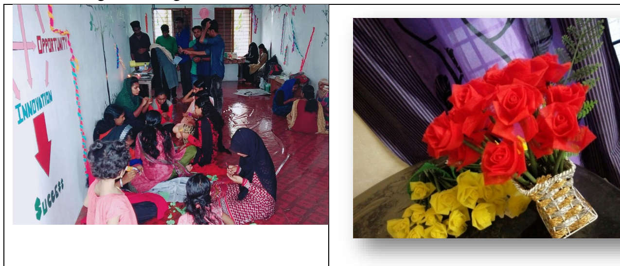
Training by Hasmi